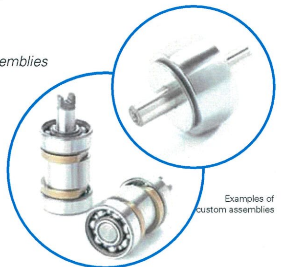
Examples of custom assemblies

We offer flexibility in product volumes from small to large batches and can design special custom packaging and kits based on your needs.